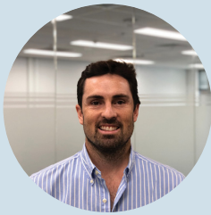
HUE FRAME Portfolio Manager